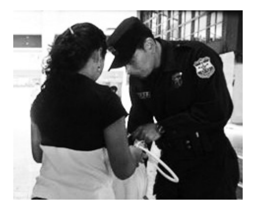
Safe Schools, aimed at bringing back the full school day, are thought to be important longterm approaches to keeping youth out of the gang circles and promoting their educational development.

Government programs and a reform making education mandatory for youth through the age of 17 or high school are now being implemented. The new "Ley Lepina" has no legal enforcement but is being adapted around the country with support from a new national institution (CONNA) to help schools, cities, communal associations, and parents find ways to keep children and youth in school. The Ley Lepina, along with a pilot program being implemented in 2014 in 1500 schools around the country (including six schools in Suchitoto) aimed at bringing back the full school day, are thought to be important longterm approaches to keeping youth out of the gang circles and promoting their educational development.