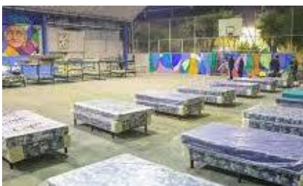
Beds in Quarantine Center-(Diario de Hoy.)

On March 12, all schools closed and the government called on the population to stay home