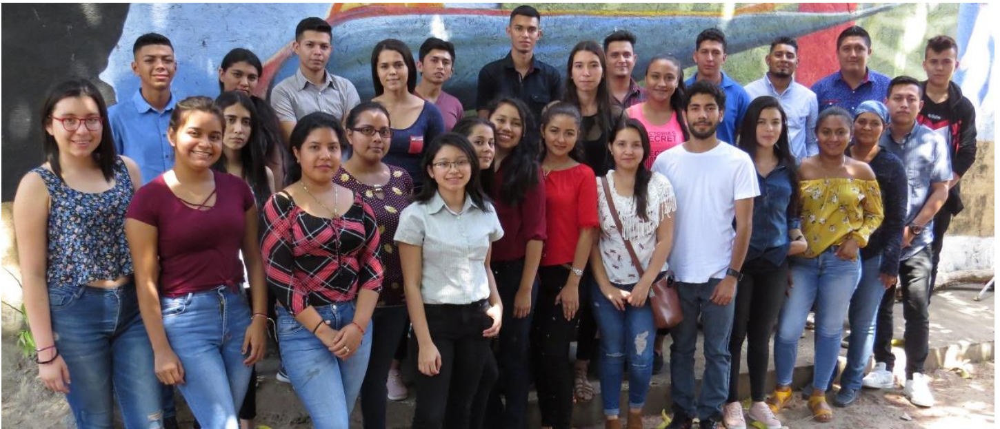
Group Photo of University Students