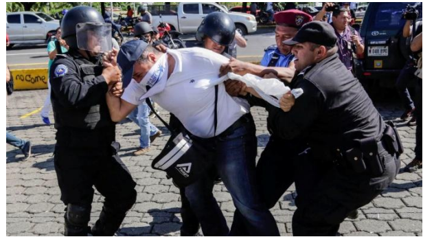
Protestor being arrested

Part of the two billion dollar emergency fund was initially meant to limit financial stress for around 1.7 million families who were to receive a stimulus of $300 each month, April through June. At the time, there was no system in place and the public announcement by the President caused thousands to break quarantine and head to local offices to see if they would receive the announced funds. With thousands