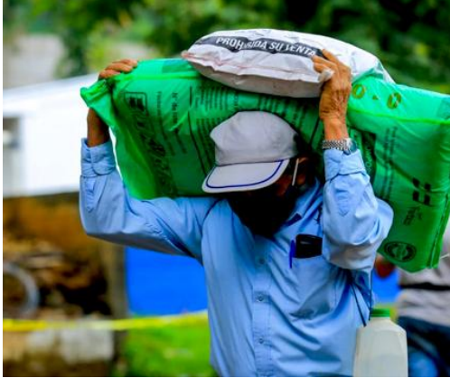
Man carrying sack of fertilizer

packages that include seeds and fertilizer for the new season. Although agricultural production is vital and must continue as normal, in my opinion the President acted prematurely, announcing the importation of hundreds of tons of basics like