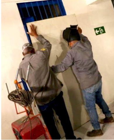
Jail cell being covered with steel plates

With all eyes and news on COVID-19, there had been very little news about El